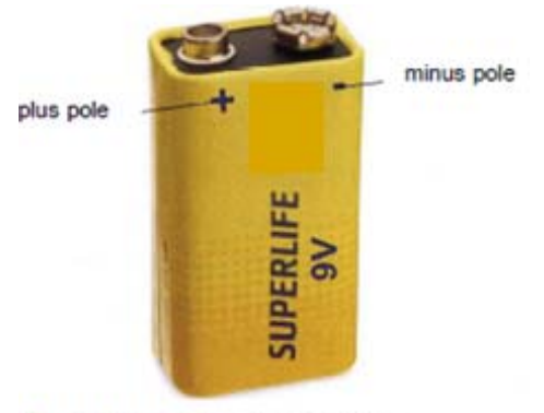
Figure 1a. Sample from the Finnish Textbook (Cantell et al., 2008, pp. 48)

The glow filament glows when the electric current runs through the wire.